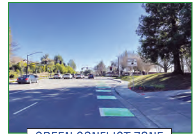
GREEN CONFLICT ZONE